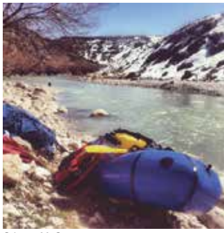
Description © Leon McCarron