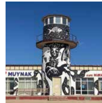
(29th October)