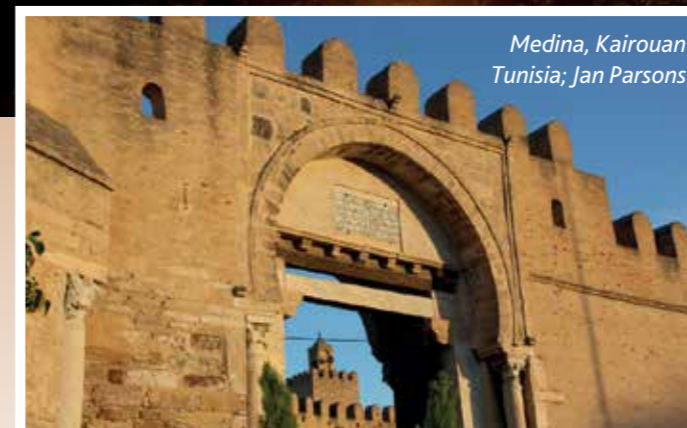
Medina, Kairouan Tunisia