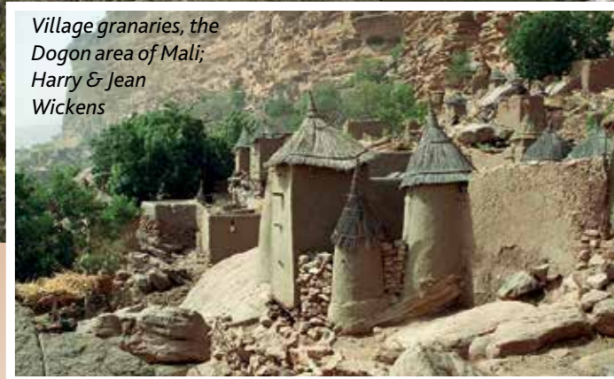
Village granaries, the Dogon area of Mali